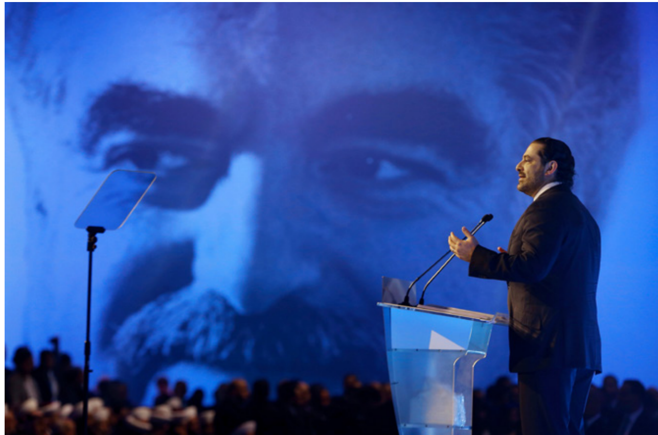
Prime Minister Saad Hariri son of slain Prime Minister Rafic Hariri

As for the Special Tribunal, yes, Lebanon did have the capacity but it was still under close Syrian influence, so it had to take place outside of Lebanon because of the political system at that time. Also, this assassination was considered an attack to international peace, hence, it justified an international tribunal. The Lebanese justice has contributed a lot as it has provided the Special Tribunal with numerous elements for proof.