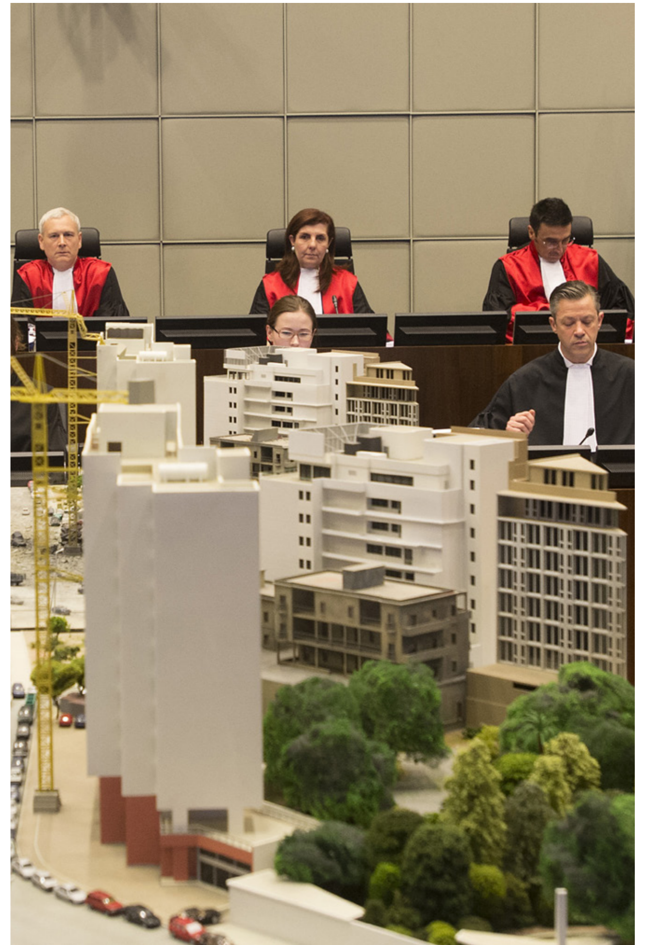
The Special Tribunal for Lebanon (STL) in session, 2020

The judge who is a member of the International Association of Women Judges and who has also studied diplomacy and strategic negotiations in Paris and Beirut, wonders in what state she will find the Court House in Lebanon after ten years of absence and is interested in exploring diplomatic endeavors after the completion of her mission with the Special Tribunal for Lebanon.