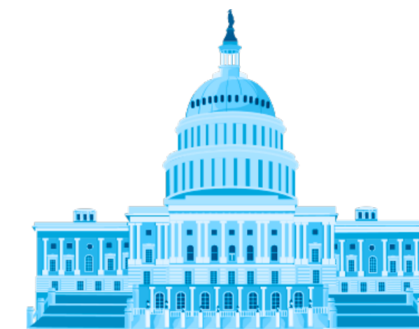
Capitol In Washington, D.C

The assault of the Capitol in Washington, D.C on January 6th was watched, commented on, and followed by millions of people around the world through social media. Never before had it been so clear that violence incited in the offline world was linked to the constant spread of misinformation and hate speech of Donald Trump. The events marked the beginning of new debates around social media, freedom of expression, and politics.