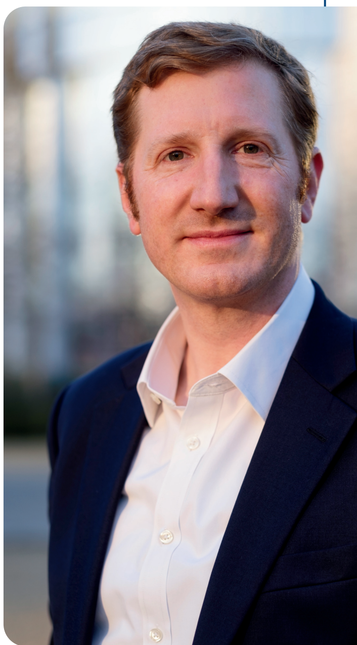
Jan-Christoph Oetjen, Member of the European Parliament FDP, Germany President of the European Liberal Forum

Germany needs a strong result of the Free Democrats (FDP) in the upcoming snap elections. Not only to ensure that the liberal voice is properly represented in parliament in the interests of all citizens, but also to ensure that our economic expertise is included in the political processes in these times of uncertainty. However, it is also clear that it will not be an easy task. Germany is facing major challenges and these can only be tackled with courageous ideas. Besides the threat of economic depression, other political challenges are ahead of us in Germany that need a liberal approach to find a suitable solution. For example, the migration policy, in which we urgently need to reduce irregular migration without neglecting the need for much needed labour force in Germany. Moreover, Russia's war of aggression against Ukraine, which continues to escalate after 1000 days.