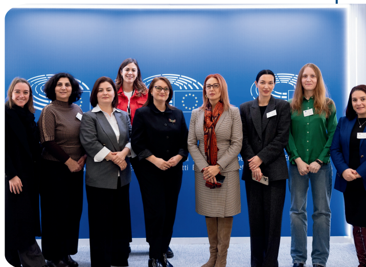
© FNF Europe Delegation on Women in Politics

FNF was honored to host in Brussels a delegation of female politicians from Ukraine, Armenia, and Georgia. During their visit, they engaged in discussions with Members of the Femm Committee, addressing the challenges they face as female leaders. Additionally, they met with Members of the European Parliament, including Dan Barna, Nathalie Loiseau and Petras Auštrevičius from the Committee on Foreign Affairs, to exchange perspectives on the political landscape in their regions.