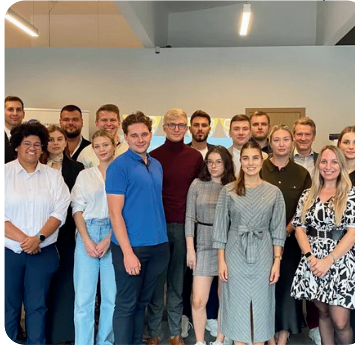
Eastern European Summit in Tallinn, Estonia

From September 13th to 15th, the Prague office of the FNF, in cooperation with the JuLis, held the fourth Eastern European Summit in Tallinn, Estonia. There, young liberals from all over Central and Eastern Europe, with the support of experts from the Estonian Reform Party, worked on policy demands on the issues of Baltic countries' membership in the European Union, security, Russian regional influence, and sustainable economics. The results were elaborated in a new position paper. It contains the collective demands of 14 liberal youth organizations across Central and Eastern Europe. They strongly believe their calls for action are essential in solving the abovementioned challenges. Their joint position paper can be accessed here .