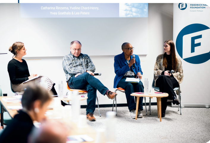
© FNF Europe Conference: Exploitation of Children in Travel & Tourism

Despite its taboo nature, FNF Europe sought to revive this critical topic through a survey on European citizens' perceptions, an image video , and a conference inviting several experts on the topic. These efforts aim to raise awareness, particularly amid ongoing EU debates on a new proposal to strengthen measures against child sexual abuse.