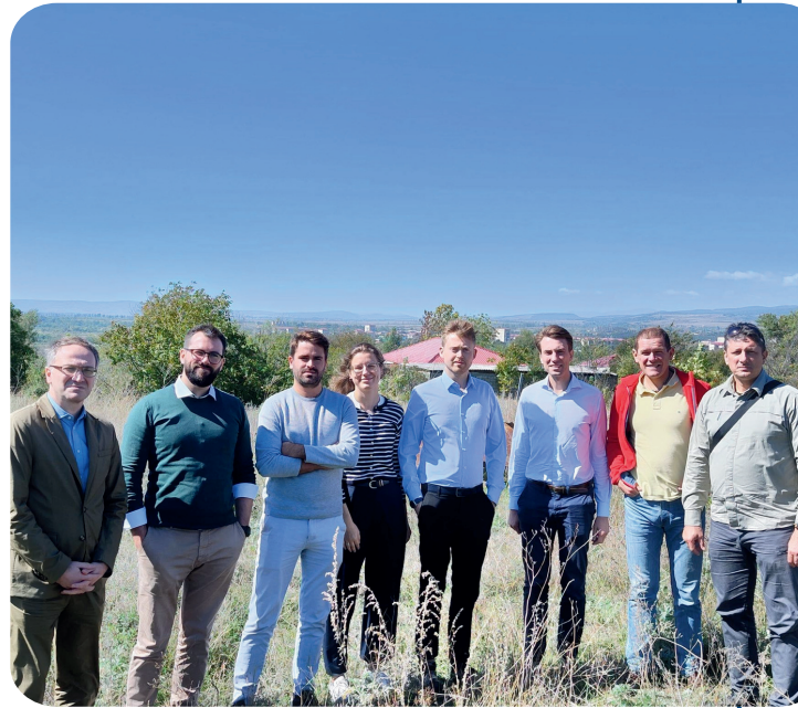
© FNF Global Security Hub Liberal Defence Expert Network in Tbilisi, Georgia

As Georgia is heading to the polls, we travelled to Tbilisi earlier this month with the Liberal Defence Expert Network to take the pulse of the political situation on the ground. Here are the main takeaways after a visit to the Georgia-Russia occupation line, participation in the Black Sea Security Conference and meetings with local experts. Georgia is a testing ground for Russian hybrid warfare method. Russia is deploying a sophisticated set of hybrid methods to influence the elections. If these are effective, we can expect them to be used elsewhere in Europe. The conflicts in South Ossetia and Abkhazia are far from frozen.