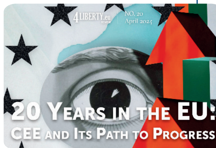
Publication: 20 Years in the EU: CEE and Its Path to Progress

This special edition celebrates the remarkable journey of Central and Eastern European (CEE) countries over the past two decades since their accession to the European Union in 2004. By reflecting on the past, assessing the present, and envisioning the future, the issue written by the members of the 4liberty.eu network delves into the profound benefits and challenges of EU membership. Additionally, it casts a forward-looking lens on the aspirations of Ukraine and Georgia as potential new members of the European community.