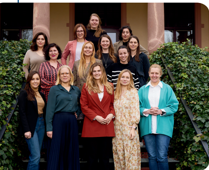
Alliance of Her in Potsdam

The "Spring" Masterclass Session, held at FNF in Potsdam, Germany; gave the participants the opportunity to take part in a series of training sessions covering political messaging, team management, campaigning, and resilience. Participants engaged in an expert-led masterclass and listened to inspiring political leaders. The sessions emphasized community building among participants.