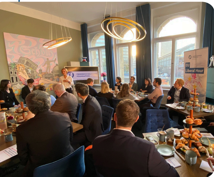
European Liberal Hour on the topic of Foreign influence in the EU

This short breakfast briefing series, established in 2023, takes place up to eight times a year. Its primary goal is to bridge the political expertise of Brussels and Berlin, providing a platform for liberal viewpoints, to present and discuss significant issues and topics in exchange with members and employees of the German Parliament, as well as other relevant actors and experts in political Berlin. Topics in 2024 included, for example, geoeconomics, foreign interference, migration, and the EU defence industry.