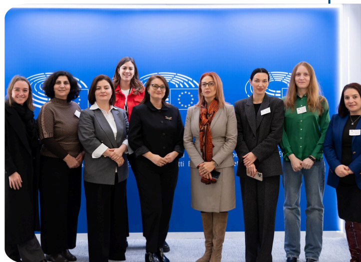
Delegation on Women in Politics