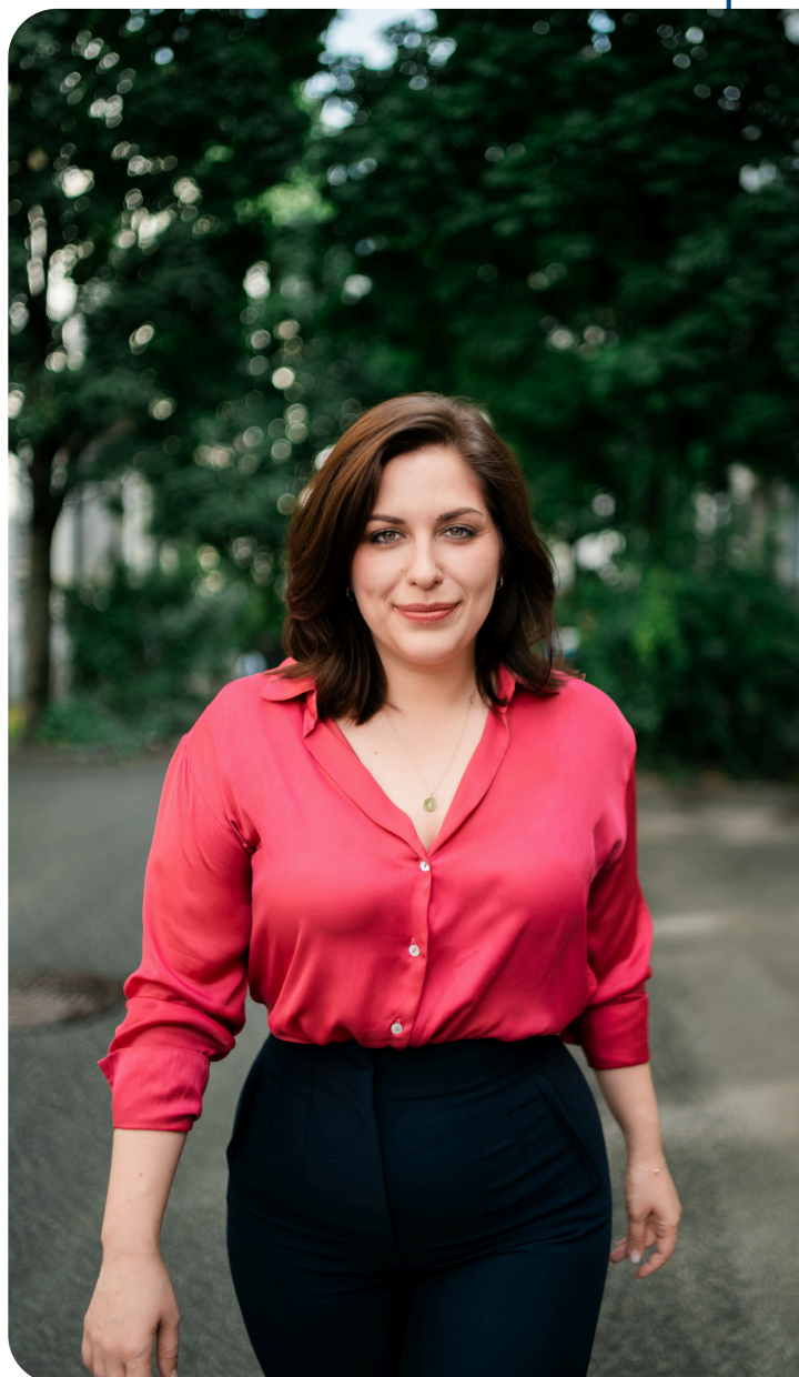
Svenja Hahn, Member of the European Parliament FDP, Germany President of ALDE Party

Despite a few steps forward in recent years, there is a long way to go to achieve gender equality in European political representation. In the current mandate of the European Parliament, only 38.7% of MEPs are women, compared to around 41% in the previous mandate. This is the first decrease since the first European elections in 1979. This is the Alliance of Her’s real mission: overthrowing an obsolete political system which is centred around the patriarchy and giving talented and hopeful women in politics the right