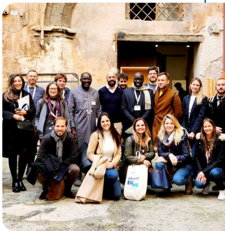
© FNF Spain, Italy, Portugal and Mediterranean Dialogue Migration Policy Group in Sicily, Italy

The programme's focus was multifaceted, aiming to address migration governance challenges, identifying opportunities for economic integration, and promoting liberal values of human rights and individual dignity in migration policy. The FNF Migration Policy Group engaged with representatives from reception centers, local authorities, and migrant entrepreneurs, which shed light into how migration processes influence both economic opportunities and challenges in Sicily.