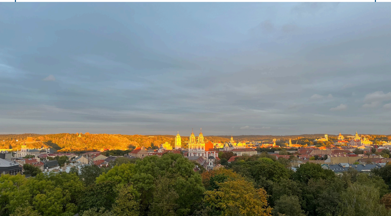
Picture of Vilnius, Lithuania

The big thing in 2025 will be the opening of our office in the heart of Vilnius, where we want to become a loud voice getting into the discussions in other parts of Europe. And we work on simulations that show what military-political and civilian cooperation mean in times of a potential attack. If we can convince more people through an experience of a simulation to act, then this is our highlight.