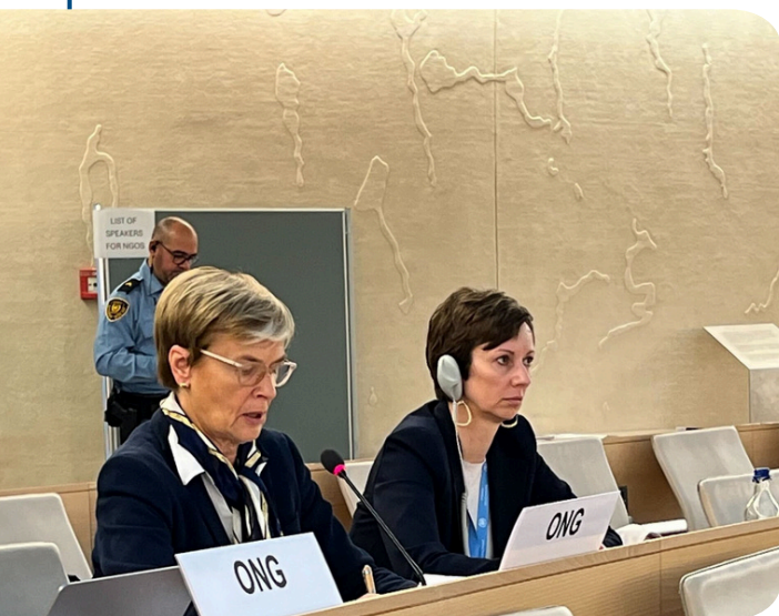
Astrid Thors speaking on behalf of Liberal International on the human rights situation in Cambodia in Room XX of the Palais des Nations, Human Rights Council 57th session.

Led by the Hub and in cooperation with Liberal International (LI), the side-event provided a unique opportunity for pro-democracy Cambodians in exile to meet with Astrid Thors from LI, the UN Special Rapporteur on the situation of Human Rights in Cambodia and diplomats. The Human Rights Hub amplified the voices of silenced activists and strengthened their platform for democracy.