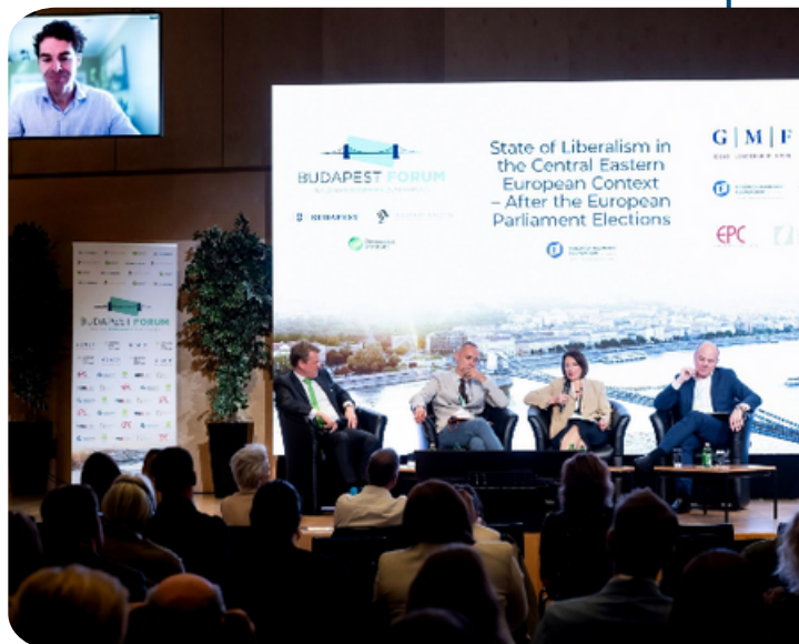
Budapest Forum in Budapest, Hungary

The Budapest Forum, organized by our partners Political Capital along with CEU Democracy Institute and Municipality of Budapest, is one of the largest and most important international policy events in Hungary. Every year since 2021, it gathers mayors, commissioners, MEPs, experts, academics, and activists, drawing them to address critical global challenges through panels, discussions, and side events. Attracting over 450 in-person participants and 40,000 online viewers annually, it has been praised for its organizational quality, thematic diversity, and focus on the pivotal role of cities. The 2024 forum, themed “The Year of Elections,” focused on democracy, the rule of law, and European integration amid Hungary’s EU Presidency and a new European Commission. It was held on September 18-19, 2024 aimed to confront democratic challenges by nurturing collaborative, impactful policy solutions.