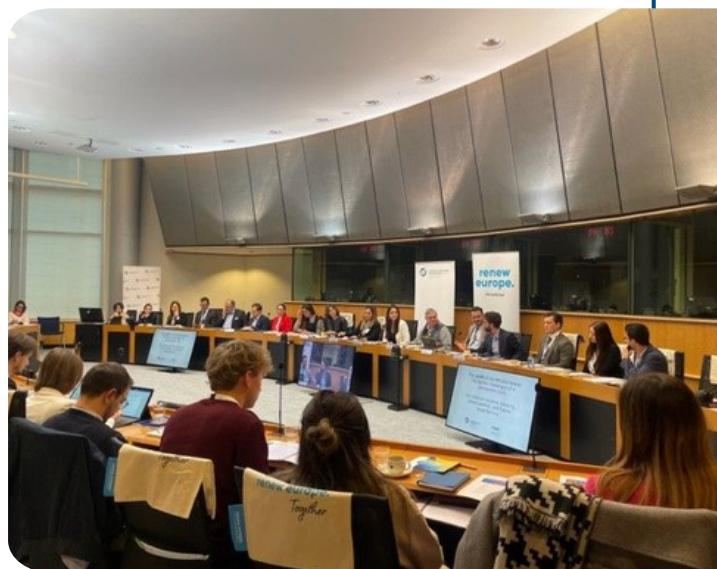
Participants of the debate Youth in the Mediterranean in the European Parliament.

In January 2024, FNF Madrid, in collaboration with its partner ESADEEcPol and Renew Europe, presented the report “The Youth of the Mediterranean and the Challenges of a Permanent Crisis: Income, Independence, Housing and Challenges” at the European Parliament. This collaboration exemplifies a shared commitment to addressing socio-economic issues and promoting liberal solutions that prioritize individual empowerment and equal opportunities.