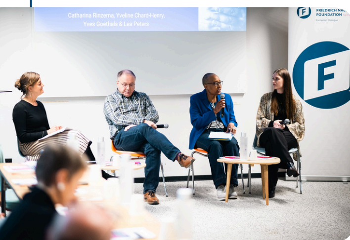
© David Malatinszky Conference: Exploitation of Children in Travel & Tourism

Despite its taboo nature, FNF Europe sought to revive this critical topic through a survey on European citizens' perceptions, an image video , and a conference inviting several experts on the topic. These efforts aim to raise awareness, particularly amid ongoing EU debates on a new proposal to strengthen measures against child sexual abuse.