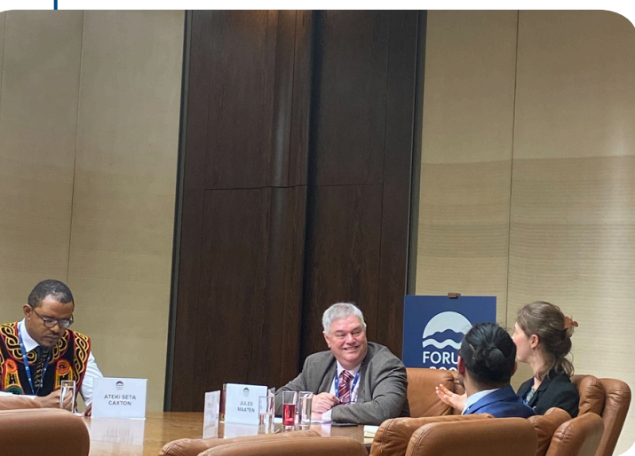
© FNF Central Europe Forum 2000 in Prague, Czech Republic