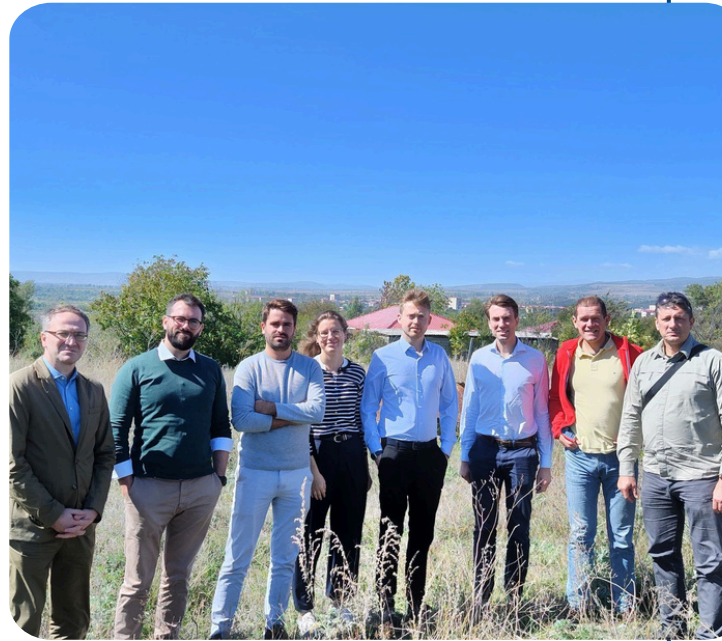
© FNF Global Security Hub Liberal Defence Expert Network in Tbilisi, Georgia

As Georgia is heading to the polls, we travelled to Tbilisi earlier this month with the Liberal Defence Expert Network to take the pulse of the political situation on the ground. Here are the main takeaways after a visit to the Georgia-Russia occupation line, participation in the Black Sea Security Conference and meetings with local experts. Georgia is a testing ground for Russian hybrid warfare method. Russia is deploying a sophisticated set of hybrid methods to influence the elections. If these are effective, we can expect them to be used elsewhere in Europe. The conflicts in South Ossetia and Abkhazia are far from frozen.