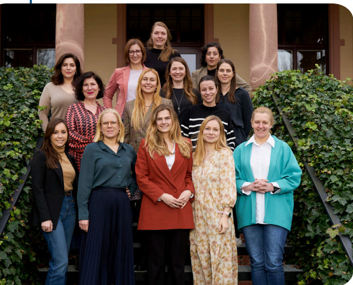
Alliance of Her in Potsdam

The "Spring" Masterclass Session, held at FNF in Potsdam, Germany; gave the participants the opportunity to take part in a series of training sessions covering political messaging, team management, campaigning, and resilience. Participants engaged in an expert-led masterclass and listened to inspiring political leaders. The sessions emphasized community building among participants.