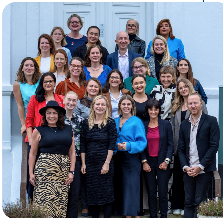
Alliance of Her in Copenhagen