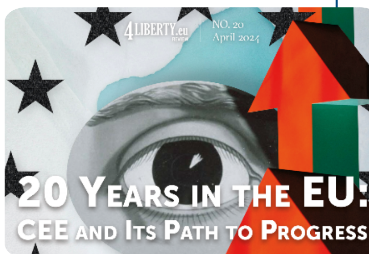
Publication: 20 Years in the EU: CEE and Its Path to Progress

This special edition celebrates the remarkable journey of Central and Eastern European (CEE) countries over the past two decades since their accession to the European Union in 2004. By reflecting on the past, assessing the present, and envisioning the future, the issue written by the members of the 4liberty.eu network delves into the profound benefits and challenges of EU membership. Additionally, it casts a forward-looking lens on the aspirations of Ukraine and Georgia as potential new members of the European community.