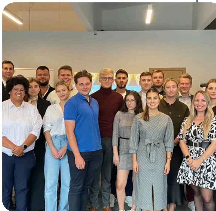
Eastern European Summit in Tallinn, Estonia

From September 13th to 15th, the Prague office of the FNF, in cooperation with the JuLis, held the fourth Eastern European Summit in Tallinn, Estonia. There, young liberals from all over Central and Eastern Europe, with the support of experts from the Estonian Reform Party, worked on policy demands on the issues of Baltic countries' membership in the European Union, security, Russian regional influence, and sustainable economics. The results were elaborated in a new position paper. It contains the collective demands of 14 liberal youth organizations across Central and Eastern Europe. They strongly believe their calls for action are essential in solving the abovementioned challenges. Their joint position paper can be accessed here .