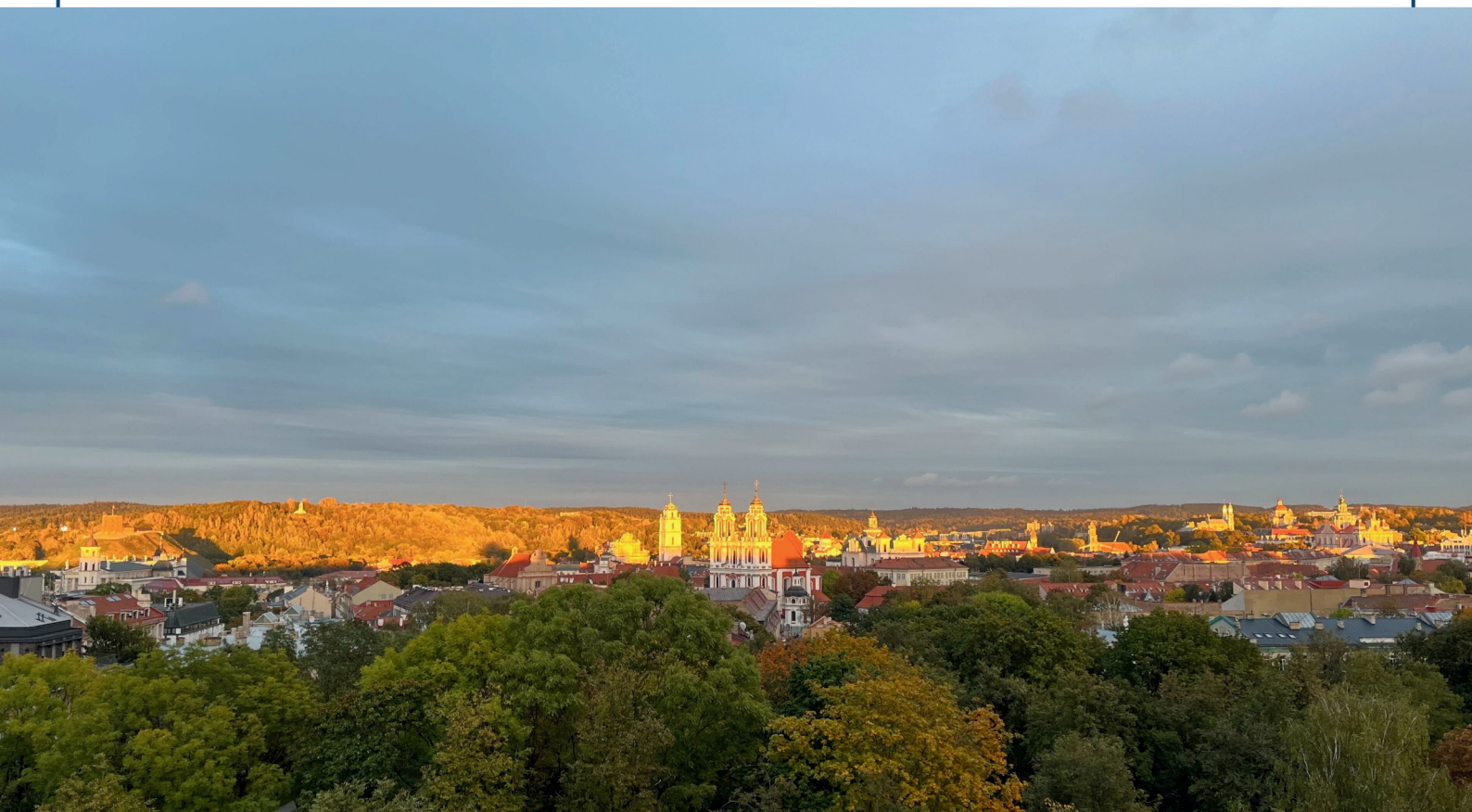
Picture of Vilnius, Lithuania

The big thing in 2025 will be the opening of our office in the heart of Vilnius, where we want to become a loud voice getting into the discussions in other parts of Europe. And we work on simulations that show what military-political and civilian cooperation mean in times of a potential attack. If we can convince more people through an experience of a simulation to act, then this is our highlight.