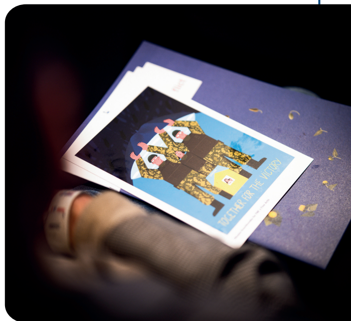
Conference: United for Ukraine-Building Resilience in Times of War

The event was live streamed to a world wide audience. The stream is available at FNF Europe .