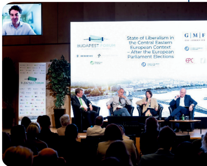
Budapest Forum in Budapest, Hungary

The Budapest Forum, organized by our partners Political Capital along with CEU Democracy Institute and Municipality of Budapest, is one of the largest and most important international policy events in Hungary. Every year since 2021, it gathers mayors, commissioners, MEPs, experts, academics, and activists, drawing them to address critical global challenges through panels, discussions, and side events. Attracting over 450 in-person participants and 40,000 online viewers annually, it has been praised for its organizational quality, thematic diversity, and focus on the pivotal role of cities. The 2024 forum, themed “The Year of Elections,” focused on democracy, the rule of law, and European integration amid Hungary’s EU Presidency and a new European Commission. It was held on September 18-19, 2024 aimed to confront democratic challenges by nurturing collaborative, impactful policy solutions.