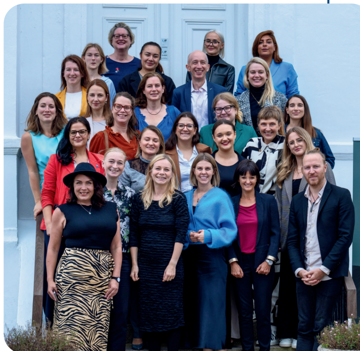
Alliance of Her in Copenhagen

The programme in cooperation with ALDE and European Liberal Forum, aims to support liberal women to lead, succeed, survive, and thrive in political life. In the autumn session the participants engaged in a series of expert-led training sessions such as public speaking, self-presentation, media communication and storytelling. They also had the opportunity to visit the Danish Parliament, meeting Eva Kjer Hansen, ALDE Vice President, to discuss the future of liberal parties.