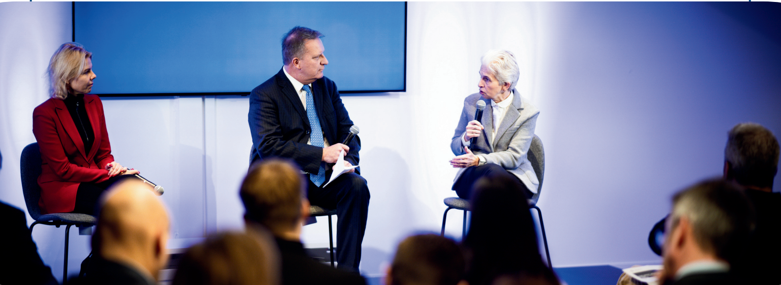
Panel: United for Ukraine: Building Resilience in Times of War