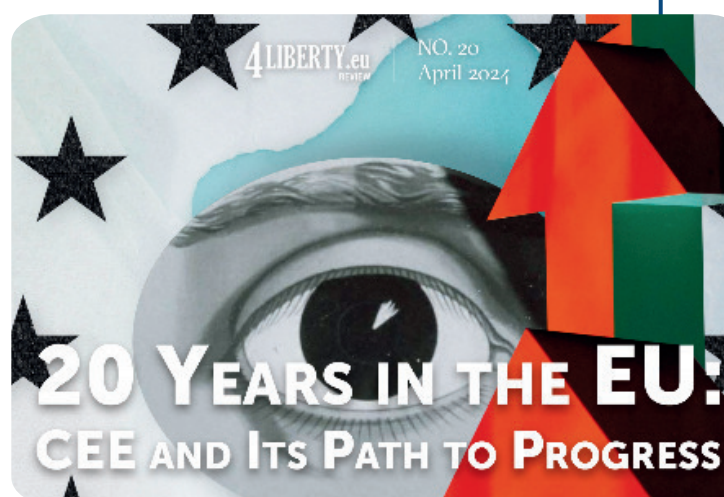
Publication: 20 Years in the EU: CEE and Its Path to Progress

This special edition celebrates the remarkable journey of Central and Eastern European (CEE) countries over the past two decades since their accession to the European Union in 2004. By reflecting on the past, assessing the present, and envisioning the future, the issue written by the members of the 4liberty.eu network delves into the profound benefits and challenges of EU membership. Additionally, it casts a forward-looking lens on the aspirations of Ukraine and Georgia as potential new members of the European community.