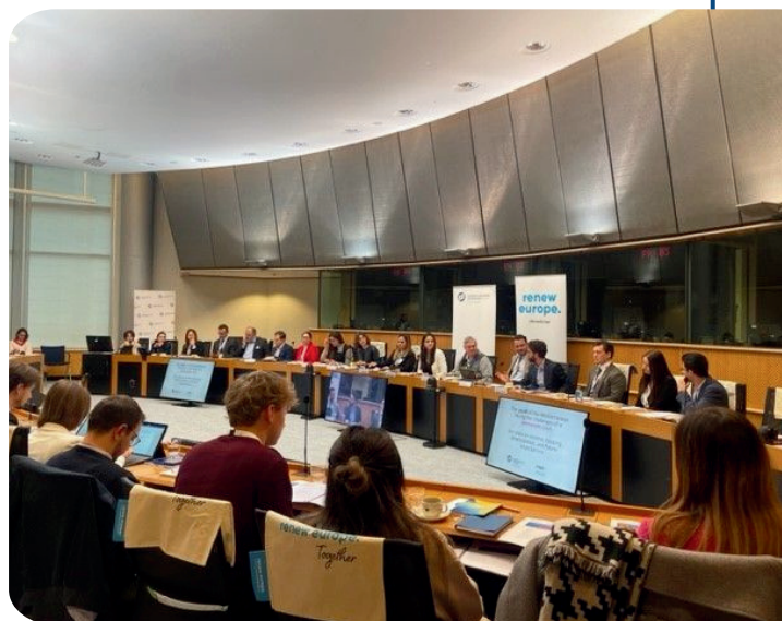
Participants of the debate Youth in the Mediterranean in the European Parliament.

In January 2024, FNF Madrid, in collaboration with its partner ESADEEcPol and Renew Europe, presented the report “The Youth of the Mediterranean and the Challenges of a Permanent Crisis: Income, Independence, Housing and Challenges” at the European Parliament. This collaboration exemplifies a shared commitment to addressing socio-economic issues and promoting liberal solutions that prioritize individual empowerment and equal opportunities.