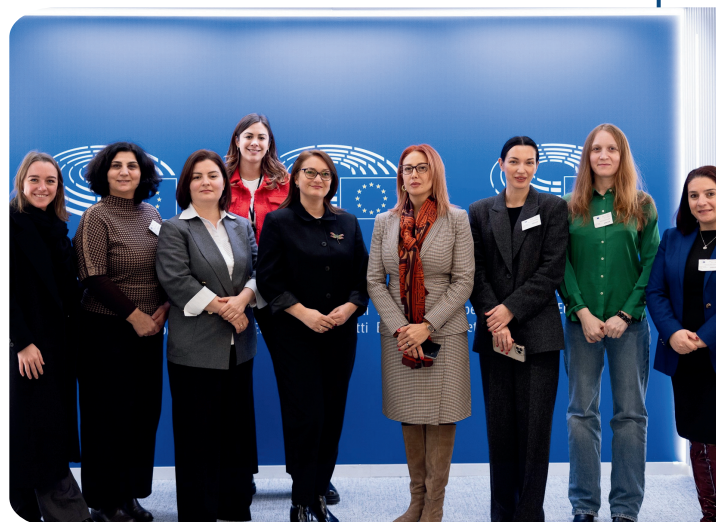
Delegation on Women in Politics

FNF was honored to host in Brussels a delegation of female politicians from Ukraine, Armenia, and Georgia. During their visit, they engaged in discussions with Members of the Femm Committee, addressing the challenges they face as female leaders. Additionally, they met with Members of the European Parliament, including Dan Barna, Nathalie Loiseau and Petras Auštrevičius from the Committee on Foreign Affairs, to exchange perspectives on the political landscape in their regions.